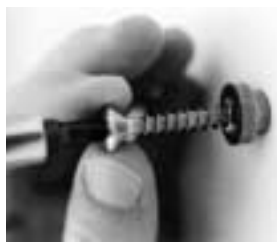
Figure 7 Mounting Pin Installation